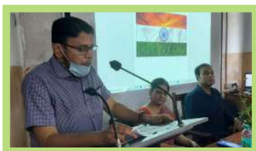
National Seminar On NEP-2020