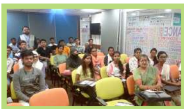
One-day Training Programme on Share-trading at BSE Institute Ltd., Kolkata