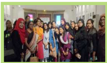
Educational Tour to Victoria Memorial and Museum