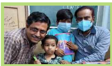
Kidderpore College Community Coaching Centre