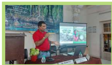
Celebration of International Mangrove Day