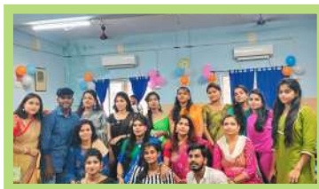
Farewell of semester 6th