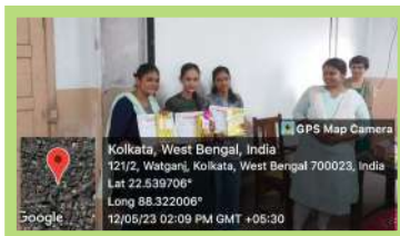
Certificate & prize distribution at the end of the quiz organised by the Dept of English