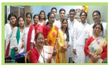
Celebration of Rabindra Jayanti