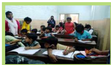
Kidderpore College Community Coaching Centre