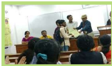
Won 2 nd Prize in Inter-college Poster Competition held at KK Das College, Kolkata