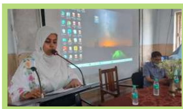
Observation of National Education Day