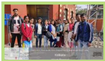
Field Visit to Alipore Central Jail to explore its history