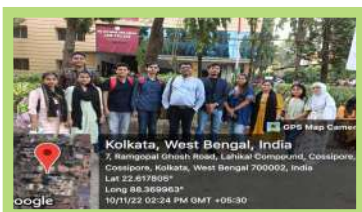
Inter-college Quiz, Debate & Business Plan Competition in TLK Jain College, Kolkata