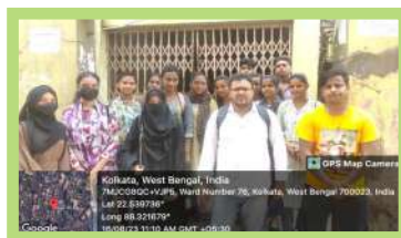
MSME Camp at Metiabruz, Kolkata