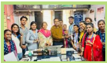
Got prize in Hindi Mela