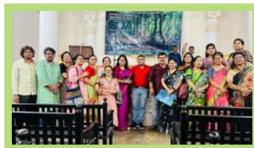
Celebration of International Mangrove Day