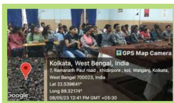
Departmental activities (Essay competition, Recitation, Quiz and Debate competition) and prize ceremony