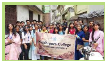
Departmental excursion in Indian Museum