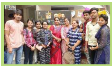
Theatre Festival organised by Little Theaspian Kolkata