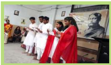
Celebration of Rabindra Jayanti