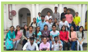
Departmental tour at Jorasanko