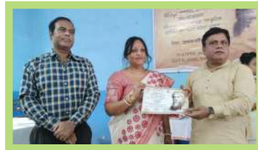
Raindra saran jointly organized by Department of Bengali, Lalbaba college and Kidderpore college