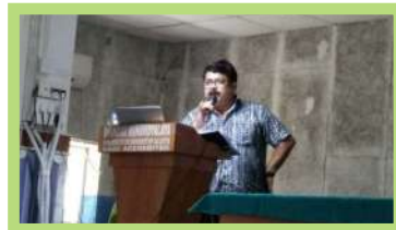
State Level Seminar on "Physical Education in Daily Life"