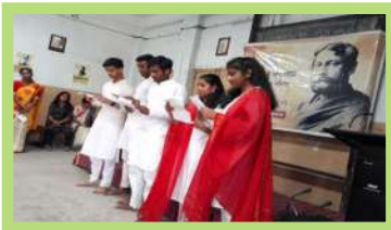
Rabindra Jayanti Function