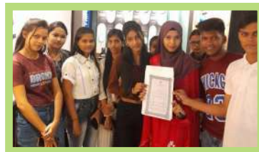
Departmental Tour in RBI Museum