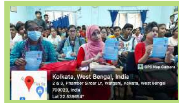
An Awareness Programme on Students' Credit Card