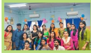
Farewell of semester 6th