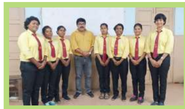
Internship by SPEW, Hastings House, Kolkata