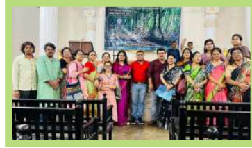
Celebration of International Mangrove Day