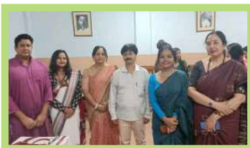
Nabin Baran Anusthan