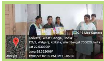
Certificate & prize distribution at the end of the quiz organised by the Dept of English