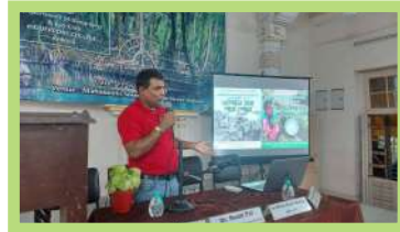
Celebration of International Mangrove Day