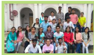
Departmental tour at Jorasanko