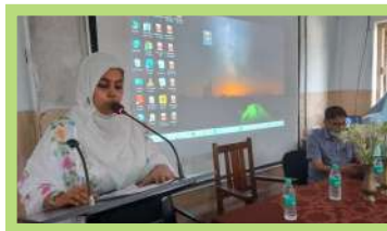
Observation of National Education Day