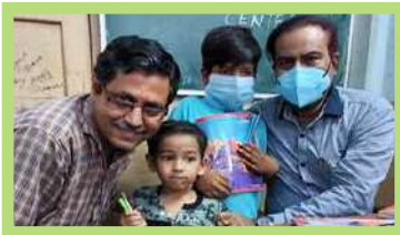
Teacher's program to teach primary students at Kidderpore College (Kolkata)