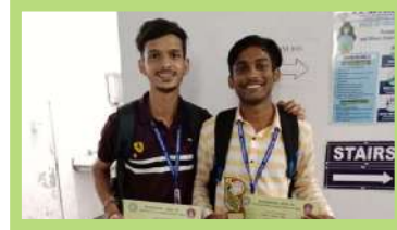
Price received on Poster competition at KK Das College (Kolkata)