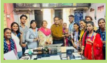
Got prize in Hindi Mela