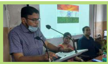
National Seminar On NEP-2020