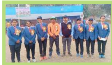
Annual Sports Meet