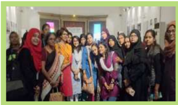
Educational Tour to Victoria Memorial and Museum