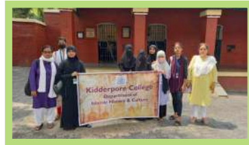
Departmental Excursion in Alipur Jail Museum