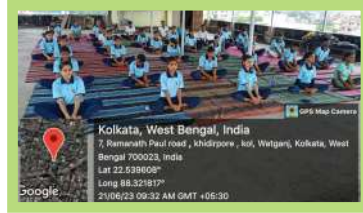
International Yoga Day celebration