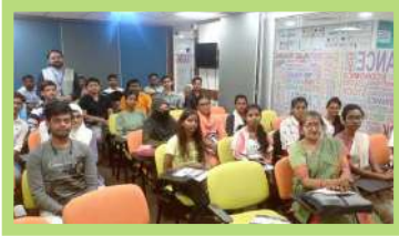
Excursion in BSE (Kolkata)