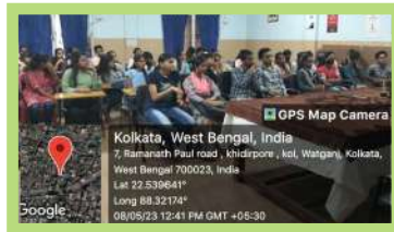
Departmental activities (Essay competition, Recitation, Quiz and Debate competition) and prize ceremony