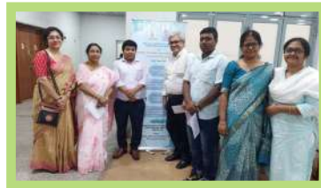
One day National Seminar jointly organized by ICSSR And Dept. of Economics. Economy - society and Sustainability : Roads to recovery