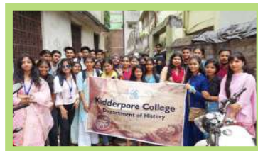
Departmental excursion in Indian Museum