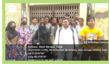
Excursion on MSME at Metiabruz (Kolkata)