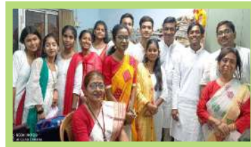
Rabindra Jayanti Function