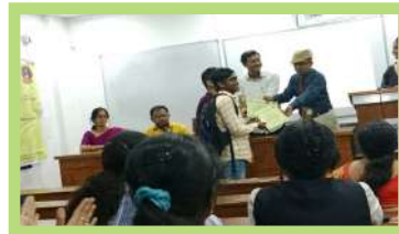
Price received on Poster competition at KK Das College (Kolkata)