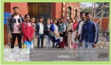
Field Visit to Alipore Central Jail to explore its history