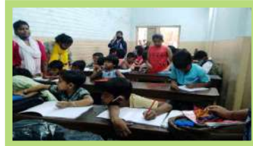
Teacher's program to teach primary students at Kidderpore College (Kolkata)