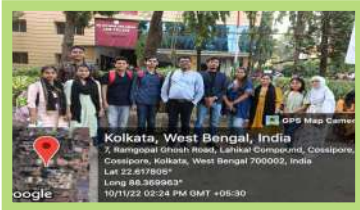
Excursion in TLK Jain College (Kolkata)